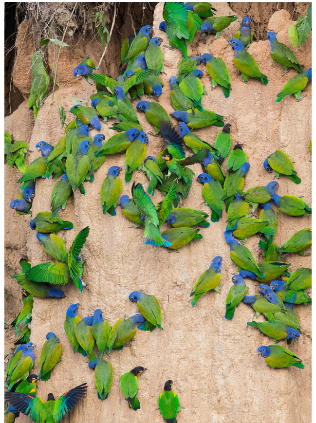
Blue-headed, Orange-cheeked, and Mealy Parrots at a Clay Lick

Exploring the Islands of Río Napo – The islands in the Río Napo support a varied avifauna distinct from that found on the "mainland" only a few hundred yards away! Island specialties we hope to see