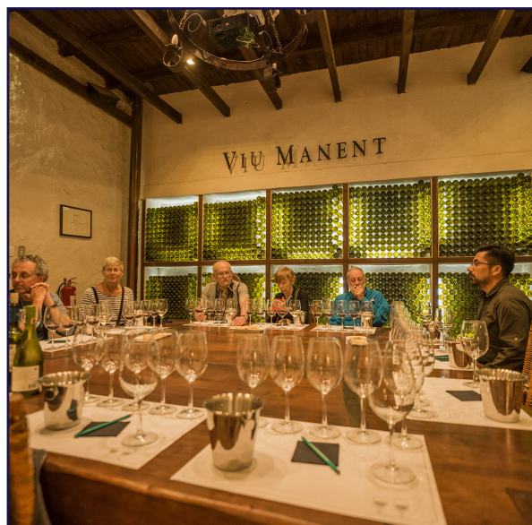
Viu Manent Vineyards

-Overnight: Santa Cruz - Hotel Santa Cruz