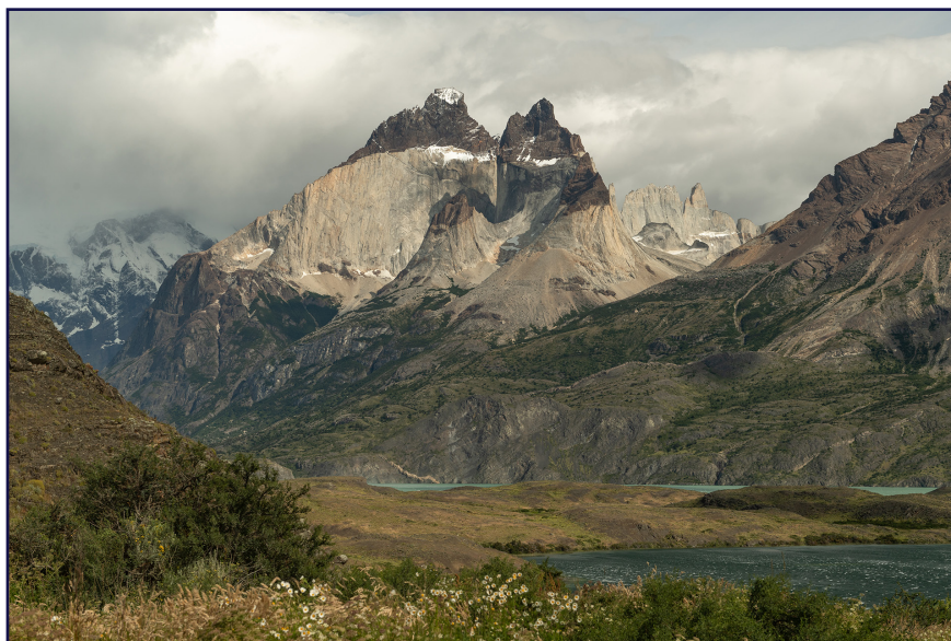
Torres del Paine

-Overnight: Puerto Natales - Weskar Lodge or similar